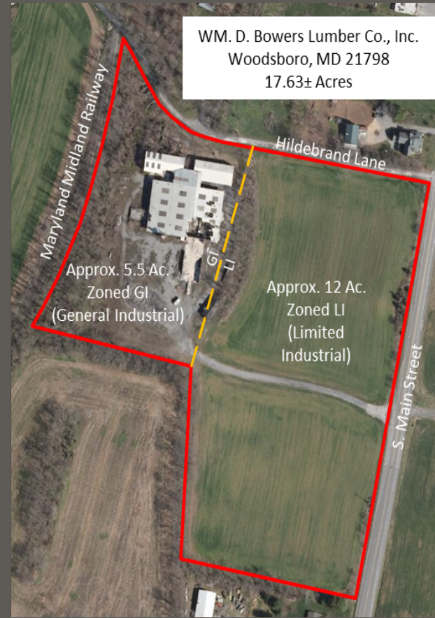
(Boundary Lines are Approximate and are for Pictorial references only)